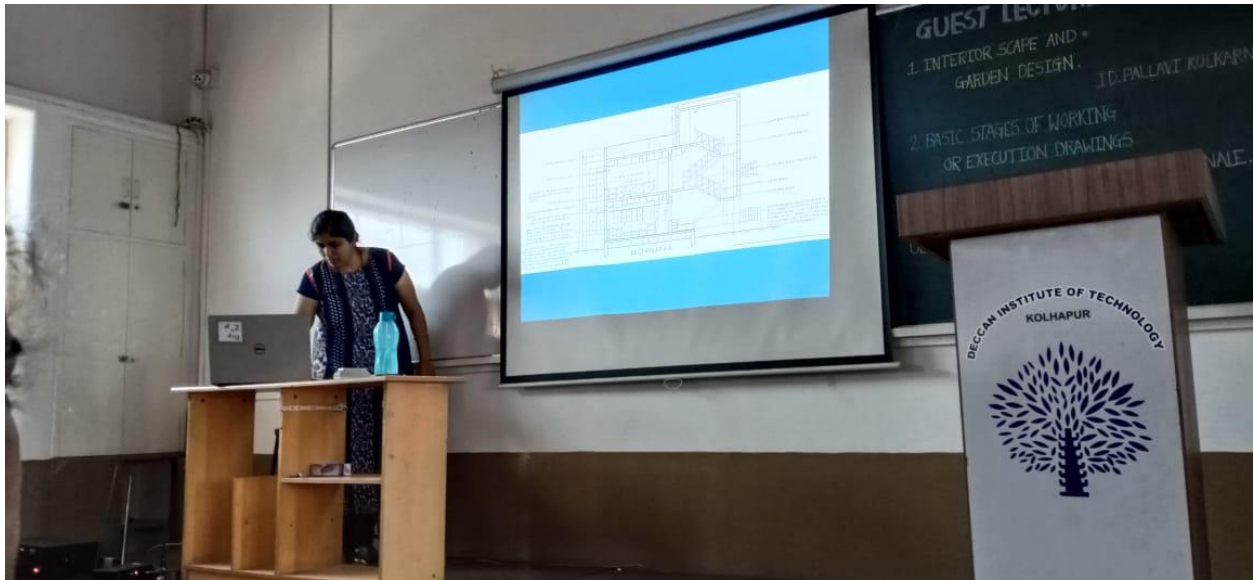
Explaining Section with Interior