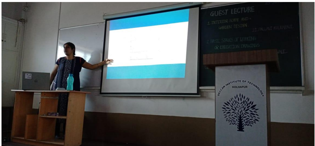
Explaining elevation with level