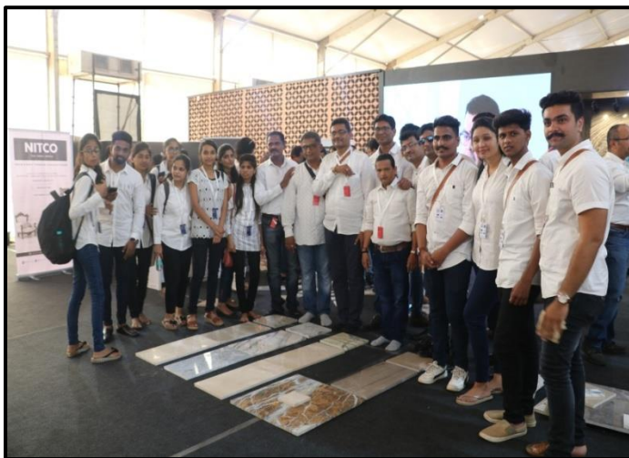
Material (tiles) display