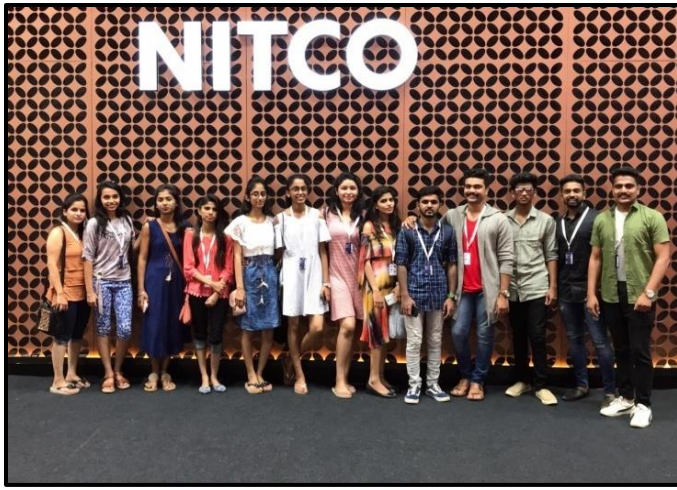
Our diploma students who attended NATCON