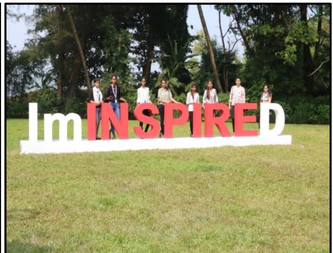
Students getting inspired and having fun .