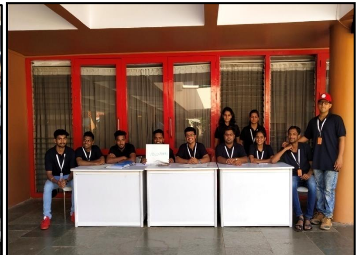
our students of degree who served as volunteers