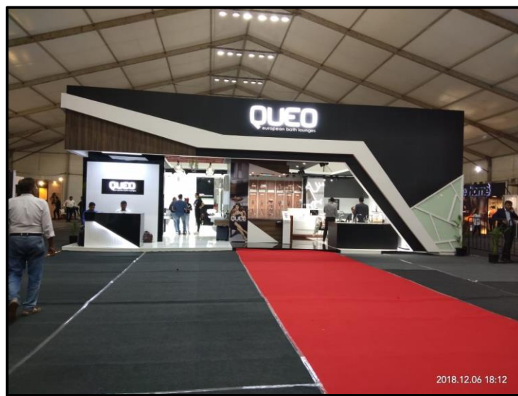
Queo is a company of sanitary fittings and had a lot of varieties of recently invented taps and other sanitary fittings using advanced technology.