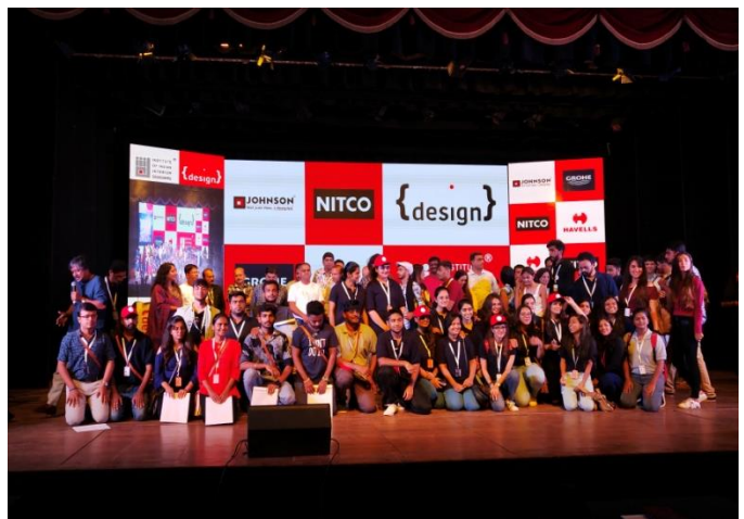
Our college represented and volunteered this event with enthusiasm