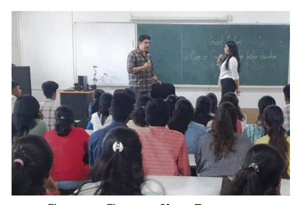
Career Counseling Lecture