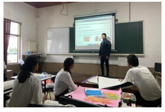
ICT Class Room